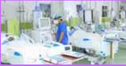
Critical Care Fundamentals Venue: Apollo Hospital, Jubilee Hills