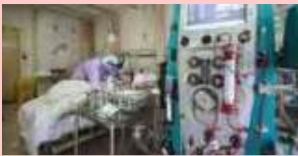
Renal Replacement Therapy Workshop Venue: Yashoda Hospital, Secunderabad