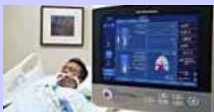
Mechanical Ventilation Workshop Venue: Continental Hospital, Gachibowli