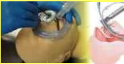
Airway Workshop Venue: Omega Multispeciality Hospital