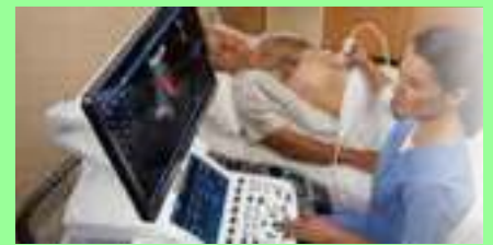
Ultrasound / 2D Echo Workshop Venue: AIG Hospital, Gachibowli