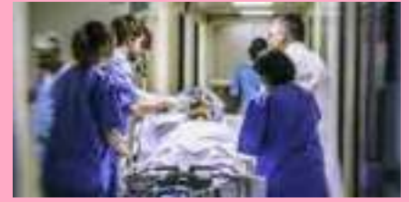
Critical Care Resuscitation Workshop Venue: Amor Hospitals, Kukatpally