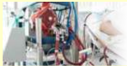
ECMO Workshop Venue: Star Hospitals, Nanakramguda