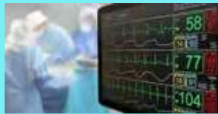
Hemodynamics Workshop Venue: Medicovert Hospital, Hitec City