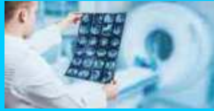
Critical Care Radiology Workshop Venue: Care Hospital, Banjara Hills