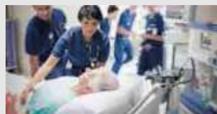
Nursing Critical Care Workshop Venue: Basavatarakam Indo American Hospital