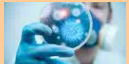
Infections and Antimicrobials Workshop Venue: Citizens Hospital, Lingampally